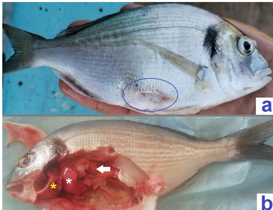
Fig. 1 (a) Skin ulcers surrounded with hyperemia (blue circle) in naturally infected Sparus aurata . (b) Congested liver with the presence of petechial hemorrhage (white Asterix), congested partially empty stomach (white arrow) and severely congested gills (yellow Asterix)

Bacterial isolates phylogenetically identified as P. putida with high similarity to GenBank data. The phylogenetic tree is shown in Fig. 2. The 16 S rRNA gene sequence was deposited in GenBank under the accession numbers (OP604345 and OP602322) for isolate KT 2440 & PP recovered from diseased S. aurata and tilapia, respectively. The alignment of both isolate sequences showed 66.3–98.1% homology to previously deposited P. putida sequences in GenBank. Isolate (KT 2440) retrieved from diseased S. aurata was closely related to the following strains: RCPN Table 2020, NB2011, SB35, S23, and 20-MO00641-0 contig00114 isolated from diseased fish in Iran, China, India, India, and Germany, respectively. Regarding isolate (PP) recovered from trash-feed (tilapia), it was closely related to GenBank strains named; LT-TA2 and AB1816 isolated from sturgeon fish and